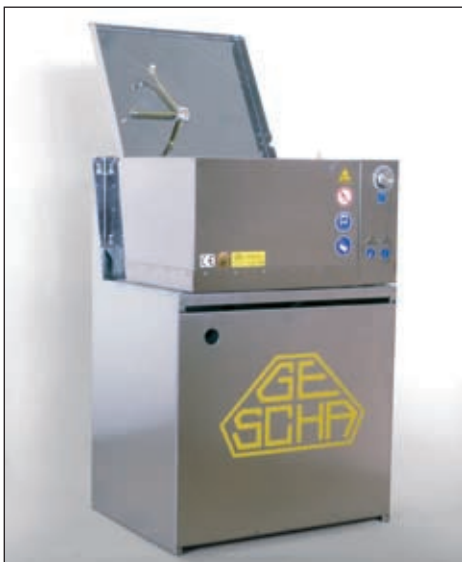
Type GW-O/A with optional undercarriage