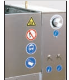
Easy to use, picture with timer, Type GW-A