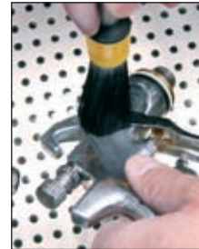
Ruckzuck Durchlaufpinsel. Die Lösemittel/Reinigungslösung läuft durch den Pinsel.