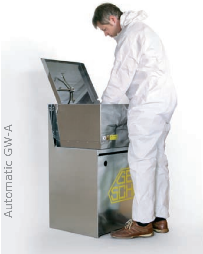
Spray gun cleaner GW-O and GW-A with optional undercarriage