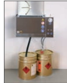
Wall mounted unit without undercarriage