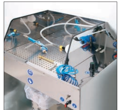
GESCHA Cleaning unit GWW-P