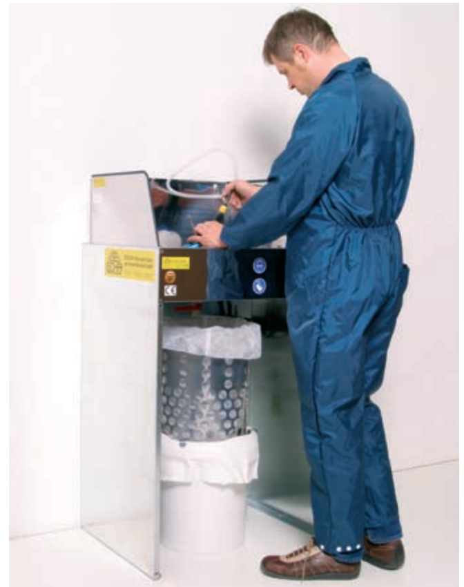
"This is how cleaning is fun"