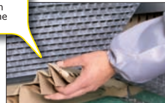
Fast filter replacement