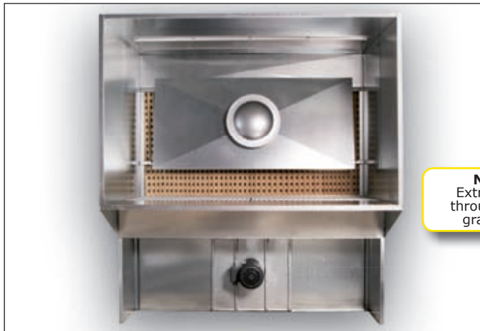
Small Part Spray Booth A1700/A2500 with optional front piece

This unit is available in two sizes . Special editions are available upon request. You have the option to order this unit with complete electric wiring and motor protection as well as ordering replacement filters.