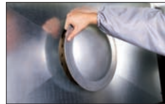
Patented GESCHA extraction system