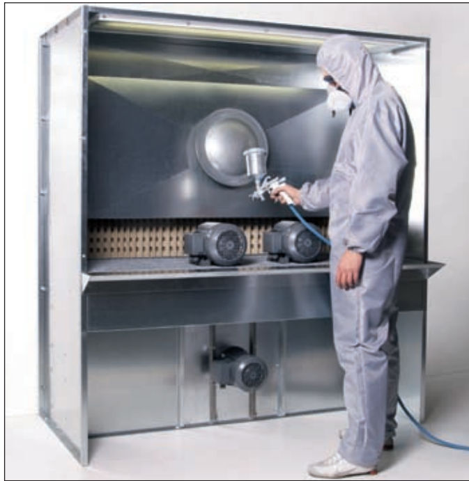
Small Part Spray booth A1700