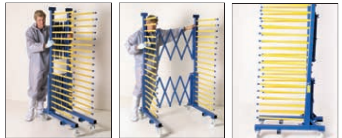
space saving: GESCHA Paint drying trolley M2-N