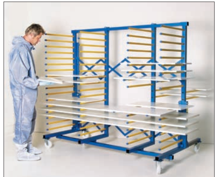
Paint drying trolley M4-N