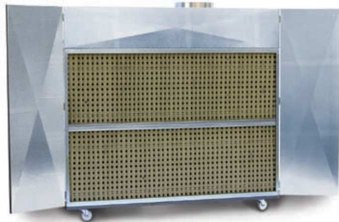
Paint JET 007-L