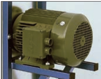
Direct drive for higher efficiency