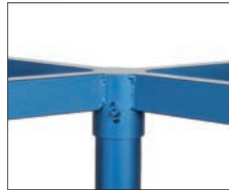
Turning resistance adjustable due to ball bearing