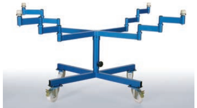
The perfect spray support for each part: GESCHA Rotary Spray Table D10