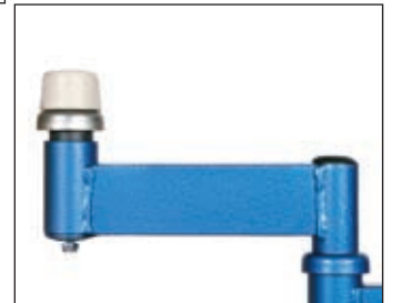
Height compensation due to spring mounted buffers