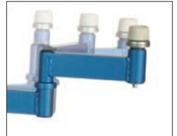
Free positioning of the support arms