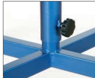
Work height adjustable