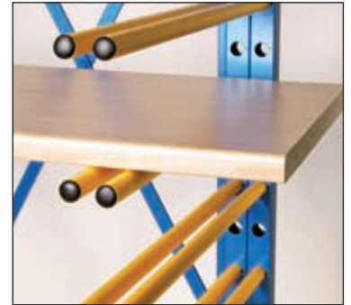
Doubled up shelf rests for heavier loads per tier