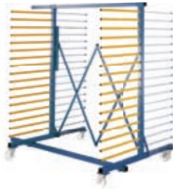
2 parts the plus of the Standard + loadable from the front and back