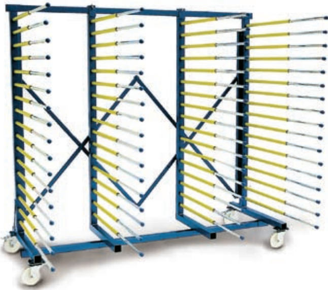
GESCHA Standard +: with two additional racks