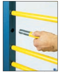
GESCHA-WikiWiki-Plug in system